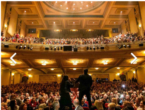
Granada Theatre